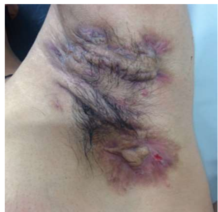
Figure 1b: Case1 – Lesions in axilla after 12 weeks of biosimilar adalimumab therapy with decreased erythema, discharge and number of inflammatory nodules