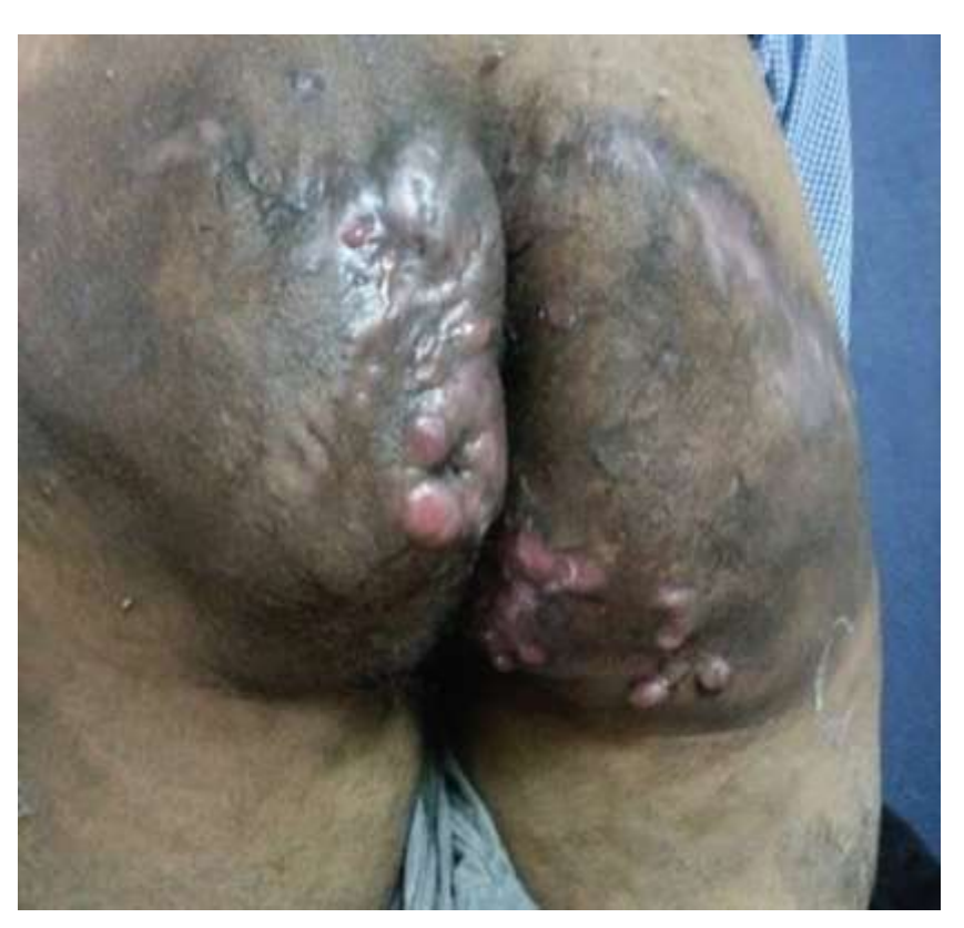
Figure 2a: Case 2 – Lesions in buttocks before biosimilar adalimumab therapy